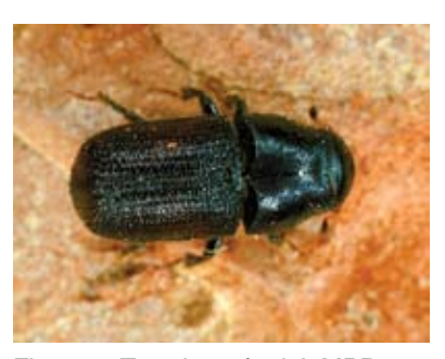
Figure 3: Top view of adult MPB (actual size, 1/8 to 1/3 inch).

Mountain pine beetle has a oneyear life cycle in Colorado. In late summer, adults leave the dead, yellow- to red-needled trees in which they developed. In general, females seek out large diameter, living, green trees that they attack by tunneling under the bark. However, under epidemic or outbreak conditions, small diameter trees may also be infested. Coordinated mass attacks by many beetles are common. If successful, each beetle pair mates, forms a vertical tunnel (egg