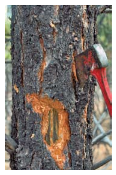
Figure 7: Checking beneath the bark for MPB. This attack was successful (note tunnels and stain).