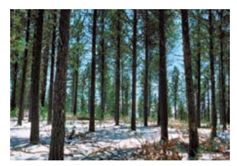
Figure 11: The appearance of a forest thinned to help prevent MPB. This can also improve mountain views and reduce fire hazard.