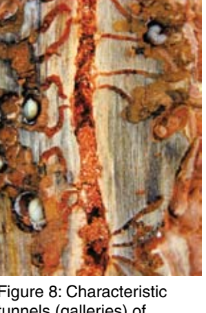
Figure 8: Characteristic tunnels (galleries) of mountain pine beetle made by the adults and larvae. The underbark area looks like this in late spring. Bluestained wood is caused by fungi the beetles introduce.

Solar treatments may be appropriate in some areas of Colorado to reduce beetle populations in infested trees. For the treatment to be effective, the temperature under the bark much reach 110 degrees Fahrenheit or more. Such treatments can be performed with or without plastic. This method is also labor intensive; contact your local forester for more details on solar treatments.