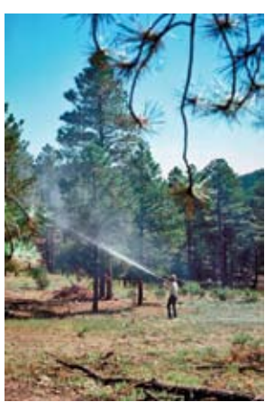
Figure 10: Large, uninfested pine being preventively sprayed. This protects high-value trees and should be done annually between April 1 and July 1.