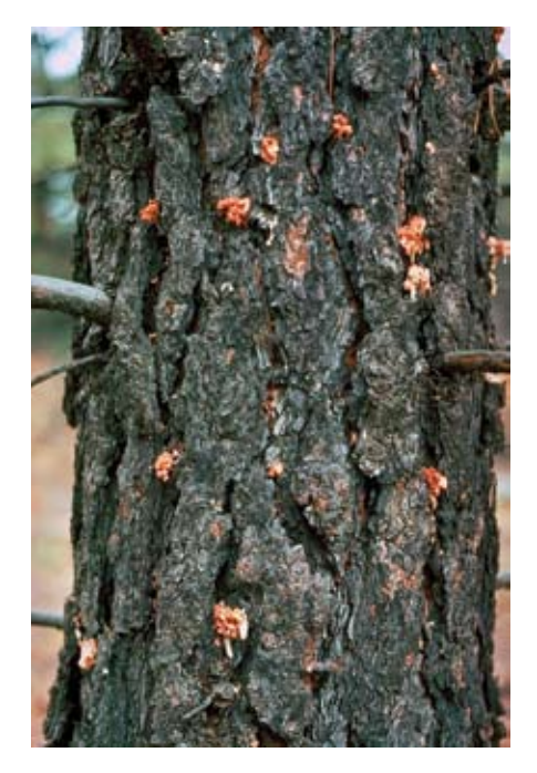
Figure 2: "Pitch tubes" indicating trunk attacks by MPB. Success of the attacks is confirmed by looking under the bark with a hatchet for beetles, their tunnels and/or bluestaining.