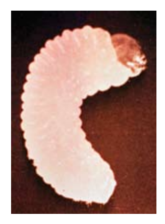
Figure 5: Larva of MPB (actual size, 1/8 to 1/4 inch). They are found under the bark in tunnels.