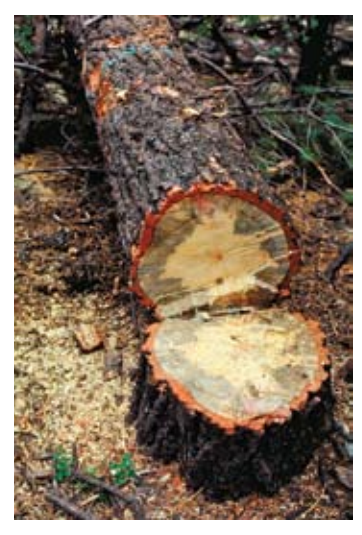
Figure 9: Cut tree killed by MPB, showing the characteristic bluestaining pattern.